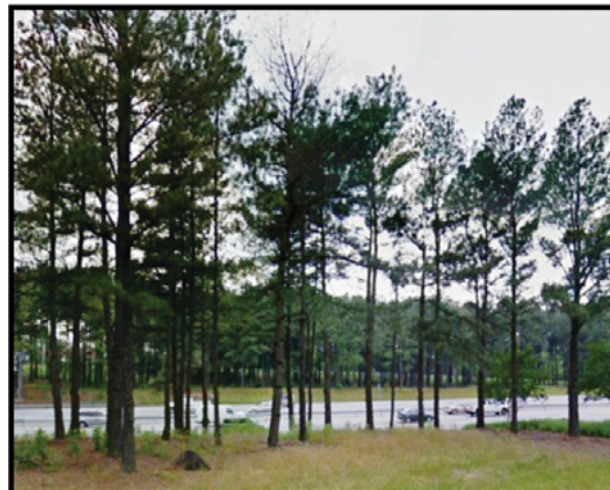
Figure 2. Examples of effective (a) and ineffective (b) roadside barriers.