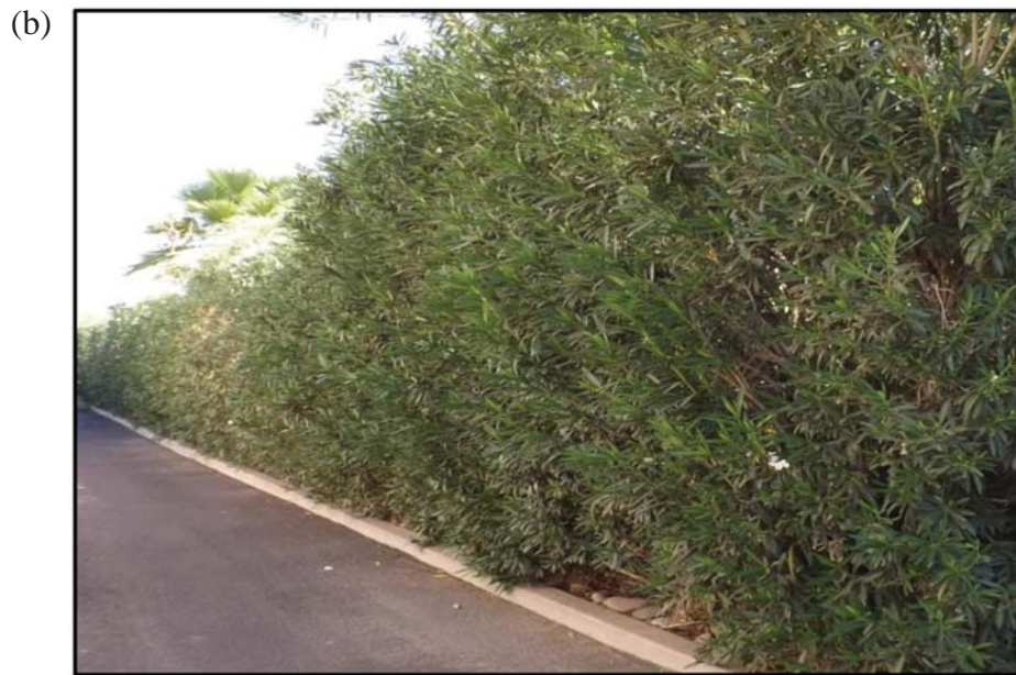
Figure 4. Examples of effective combinations of vegetation with solid noise barriers. Panel (a) shows vegetation behind the barrier (as studied in Baldauf et al., 2008) while panel (b) shows bushy vegetation in front of the barrier (no empirical evidence available).