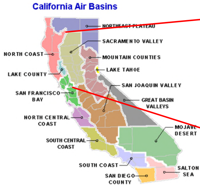
Sacramento Valley Air Basin