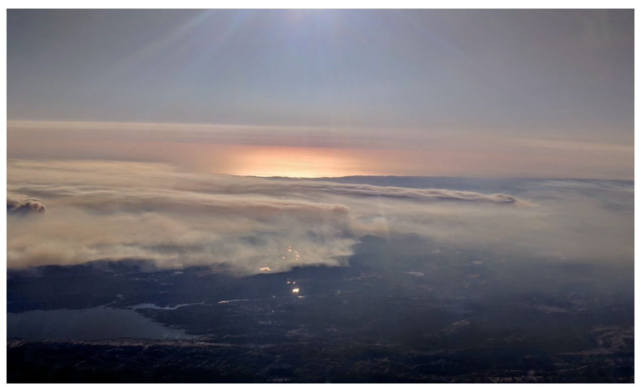
(Aerial view of the Tubbs and Pocket fires, 10/12/2017)